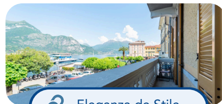
Eleganza de Stile

This is a rental apartment perfectly situated right across from the ferry dock in Bellagio. We had three bedrooms (two families) with two bathrooms, a full kitchen, and laundry. The view was amazing. We could watch people and ferries, see the mountains, and feel the hustle and bustle of the town. There is a coffee shop, restaurants, and gelato steps from the front door.