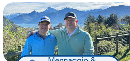
Menaggio & Cadenabbia Golf

This is an outing for golfers of all skill levels. We played at Menaggio & Cadenabbia Golf Club, the second-oldest golf club in Italy. It's an easy ferry from Bellagio port to Menaggio port. The course has stunning views and is a fun way to spend a morning in Europe.