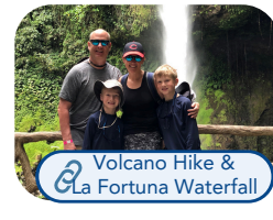
Volcano Hike & La Fortuna Waterfall

This was an active hiking day. We hiked parts of the rainforest, climbed parts of a volcano, and climbed the La Fortuna waterfall. It's 500 steps to the waterfall basin (which is amazing). The climb back up isn't too tough.. take your time and enjoy the view.