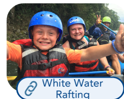
White Water Rafting

One of our favorite memories from the trip. Our last full day was white-water rafting on the Balsa River. The guides set you up for success and are in the boat with you. We went about 6 miles downriver in class 2/3 rapids. Guides point out amazing sites and wildlife along the river, and at the end, you are treated to a traditional Costa Rican lunch.