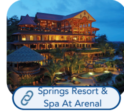
Springs Resort & Spa At Arenal

We flew into San Jose and rented a car. The first stop was Walmart to stock up on snacks and beverages. From there, we drove 3 hours to the hotel. We stayed for 6 days at the Springs Resort & Spa at Arenal . The hotel is a perfect central location for all activities in the area. This luxury property has many amenities - large rooms, 15 pools, a swim-up bar (with the best milkshakes), 5 restaurants, a mini putt-putt course, a mountain waterslide, and a kids' video game/play area.