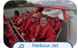
Harbour Jet Boat Thrill Ride

This 30-minute thrill ride is exhilarating! Our crew absolutely loved it. The ride combines thrilling spins, sharp turns, and splash-filled fun on the water. As you race across the harbour, you'll see incredible views of the city. A great way to get the blood going.