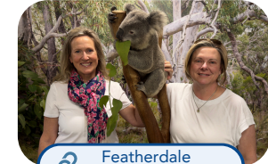
Featherdale Wildlife Park

An unforgettable hands-on, up-close experience with Australia's most iconic animals. We pet koalas, fed kangaroos, and saw rare dingoes and Tasmanian devils up close. You can't go to Australia without experiencing the country's unique wildlife.