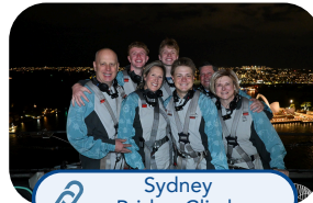
Sydney Bridge Climb

We loved climbing the iconic bridge. It was thrilling and awe-inspiring. We climbed at sunset, and at the summit, the panoramic views of the harbor are amazing. The guides get you suited up and trained for the climb - it's great for everyone!