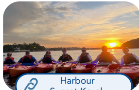
Harbour Sunset Kayak

A beautiful and unforgettable way to watch the sun go down. We kayaked from Lavender Bay and glided along the coastline. The scenery was amazing as the sunset hit. It was so relaxing and stunningly beautiful to see the city from this perspective.