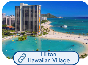
Hilton Hawaiian Village

A good hotel that is great for families. Lots of pools, waterslides, lagoons and restaurants. Nice option for multi-generational families - kids can play while grown-ups can lounge, read or play along.