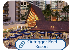
Outrigger Reef Resort

A highly-rated hotel, near the Royal Hawaiian Center. Pools, spas, beach service, plenty of restaurants and lots of on-site activities.