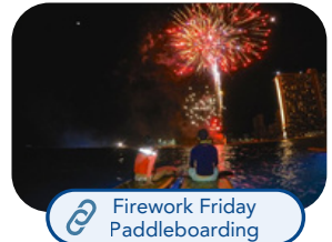
Firework Friday Paddleboarding

An amazing experience - even if you're not a strong paddle boarder. You go out on paddle boards right off Waikiki Beach at dusk - paddle on your knees or standing. The boards light up (attract turtles) and watch the fireworks while floating!