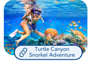
Turtle Canyon Snorkel Adventure

This experience gets rave reviews from all that have done it. Turtle sightings guaranteed. Includes transfer from Waikiki and catamaran transport to snorkeling spot.