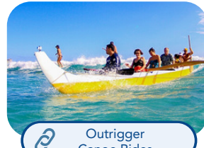
Outrigger Canoe Rides

See Waikiki from the water! Ride an outrigger canoe together and experience a Hawaiian tradition! It is a blast. You paddle the board out to the surf break and surf multiple waves.