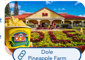
Dole Pineapple Farm

Taste the best pineapple in your life! Visit the farm, see the heritage, learn all the steps about growing - harvesting, processing, and packing. Really interesting and only in Hawaii! Plus there are lots of sampling moments!