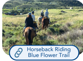
Horseback Riding Blue Flower Trail

This ride is breath-taking. See the beauty of Paradise Valley with a guided ride. Take in the view of the Absaroka Mountains and see wildlife like elk and golden eagles. Guides share information about the landscape and the history. Great photo ops!