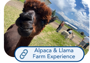
Alpaca & Llama Farm Experience

Our kids loved this so much! It was a great first day activity as we waited for our hotel to be ready. We got up close to the animals and were able to be hands-on. We learned about feeding, bathing, walking, fleece usage and even spotted a baby - so cute!