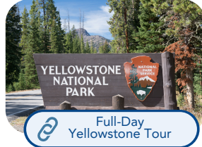
Full-Day Yellowstone Tour

This is an amazing day in this fantastic park. You will drive scenic roads, walk historic boardwalks, see Old Faithful, Grand Prismatic Spring Lower and Upper Falls, Grand Canyon of the Yellowstone Geysers, Hot Springs, Mudpots & Fumaroles. Great pic spots too!