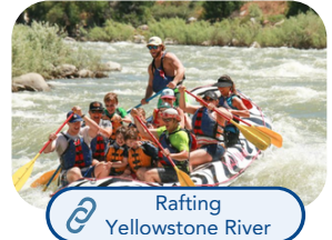
Rafting Yellowstone River

We like a good adrenaline rush with our crew. This two-hour adventure rides down the river with a professional guide. You cover some exciting rapids in calm waters and can even hop in for a swim. The rapids are Class II & III.