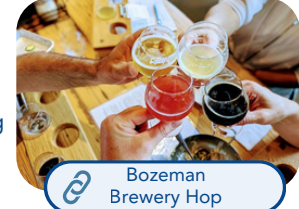
Bozeman Brewery Hop

Learn and have fun drinking beer with one of the few Master Cicerones in the world. You'll get to taste many beers and ciders, sample different barley malts and hops, pick up tasting tips, and see brewing up close. It's a great evening experience before dinner!